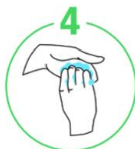
The back of the fingers