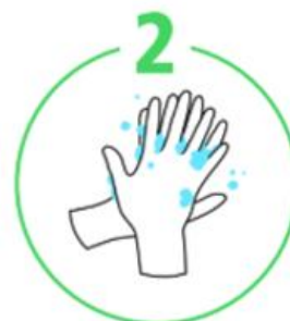
The backs of hands