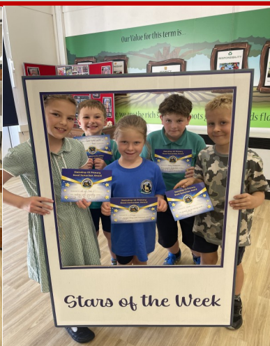
Stars of the Week