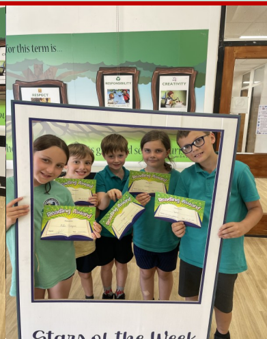
Stars of the Week